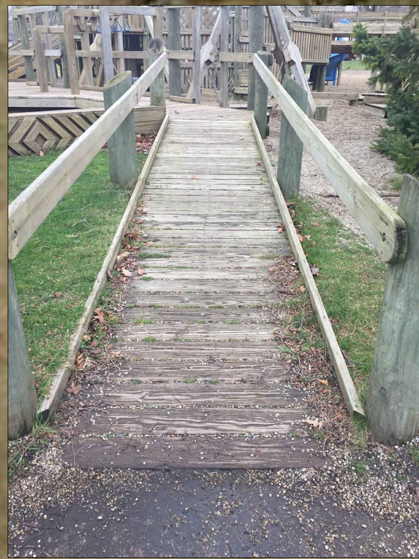
PHOTO OF EXISTING WOOD RAMP