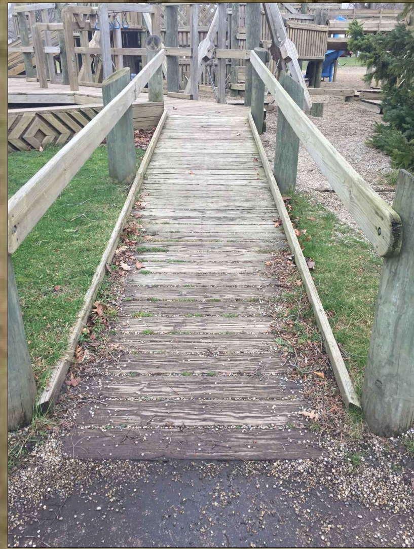
PHOTO OF EXISTING WOOD RAMP